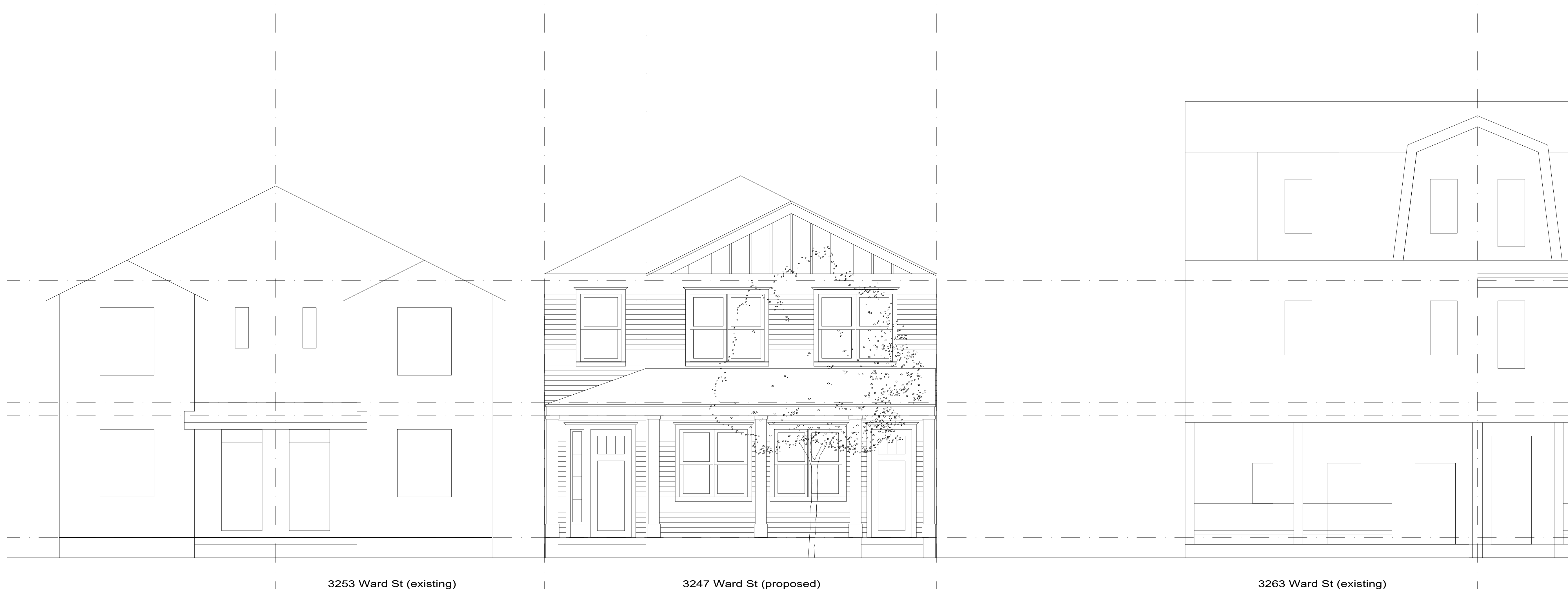
3253 Ward St (existing)